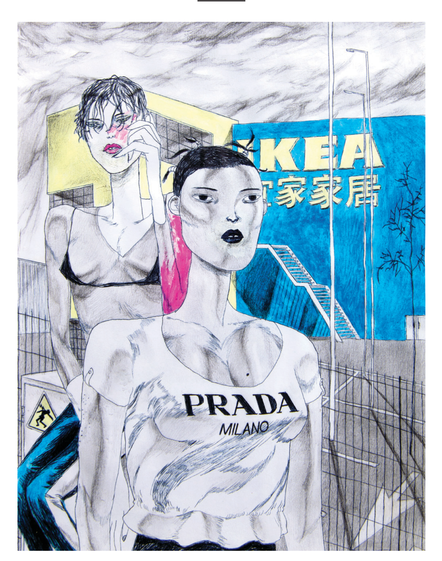
David Rappeneau, Untitled (2015). Acrylic, ballpoint pen, fluorescent marker, pencil, charcoal pencil on paper.